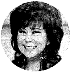
Professor Dato' Dr