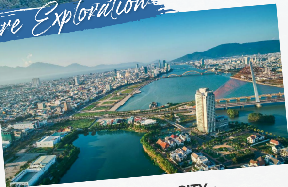
THE VIBRANT COASTAL CITY - SUMMER PARADISE DANANG CITY