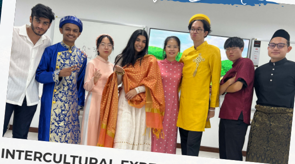
INTERCULTURAL EXPERIENCES & PERSONAL DEVELOPMENT