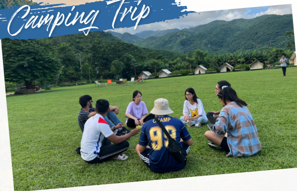
PEER CONNECTION & NATURE APPRECIATION