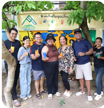
Community Service Activities