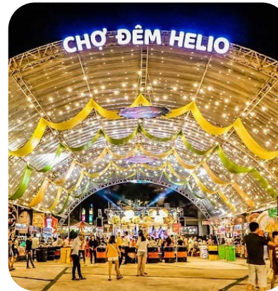
Night Market Exploration